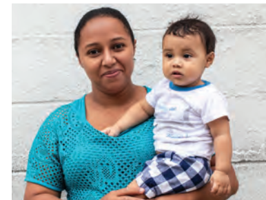
ESL (English as a Second Language)