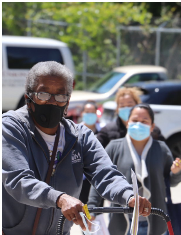
Family Ministry Center guests are careful about social distancing. Since the COVID-19 pandemic, we have seen a 50% increase in emergency food requests.