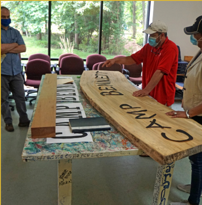
Camp Bennett is undergoing an exciting upgrade this summer and offers private primitive riverfront campsites for families and small groups