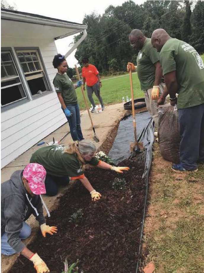
Phase One included painting and landscaping.