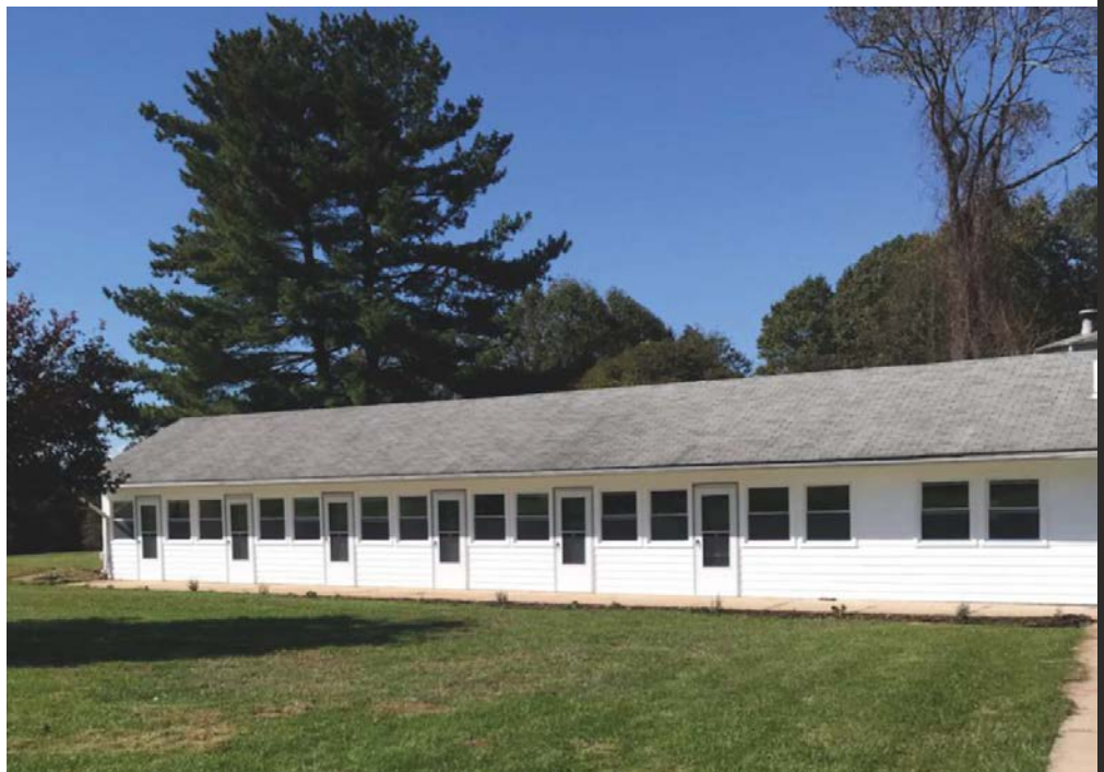
Home Depot donated and installed the Hanlon House's new energy efficient windows and doors.