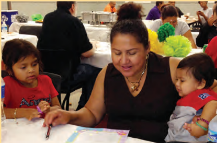
Our September Hearts of Hope Baby Shower was a delight for our expectant and new mothers. They enjoyed a light lunch with baby shower games and favors, as well as sage advice from experienced moms. Our generous friends supplied so many presents that the chapel stage was full. We distributed the gifts among families participating in our Family Ministries program and Food PLUS Center.

You can be a hands-on part of Central Union Mission’s ministry, too. Register at missiondc.org/volunteer today.