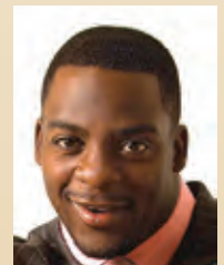
Redskin Clinton Portis