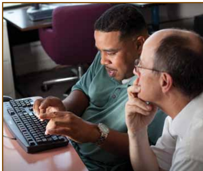
Sharing your computer skills may help someone pass the GED exam or get a job.