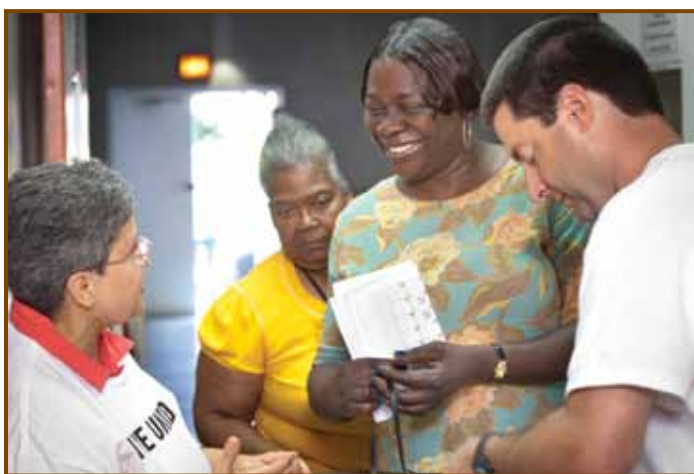
Neighbors serving neighbors: your organization can help.