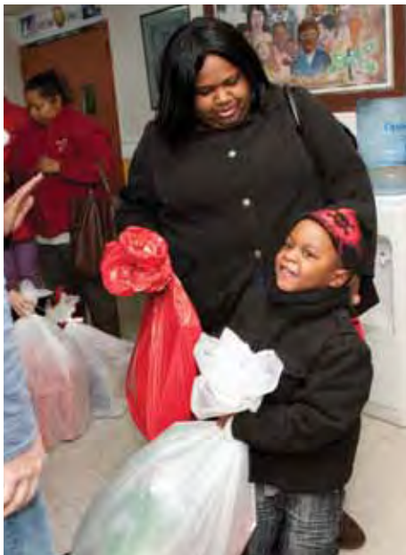
Operation Christmas Miracle brings grateful smiles from children and their parents.