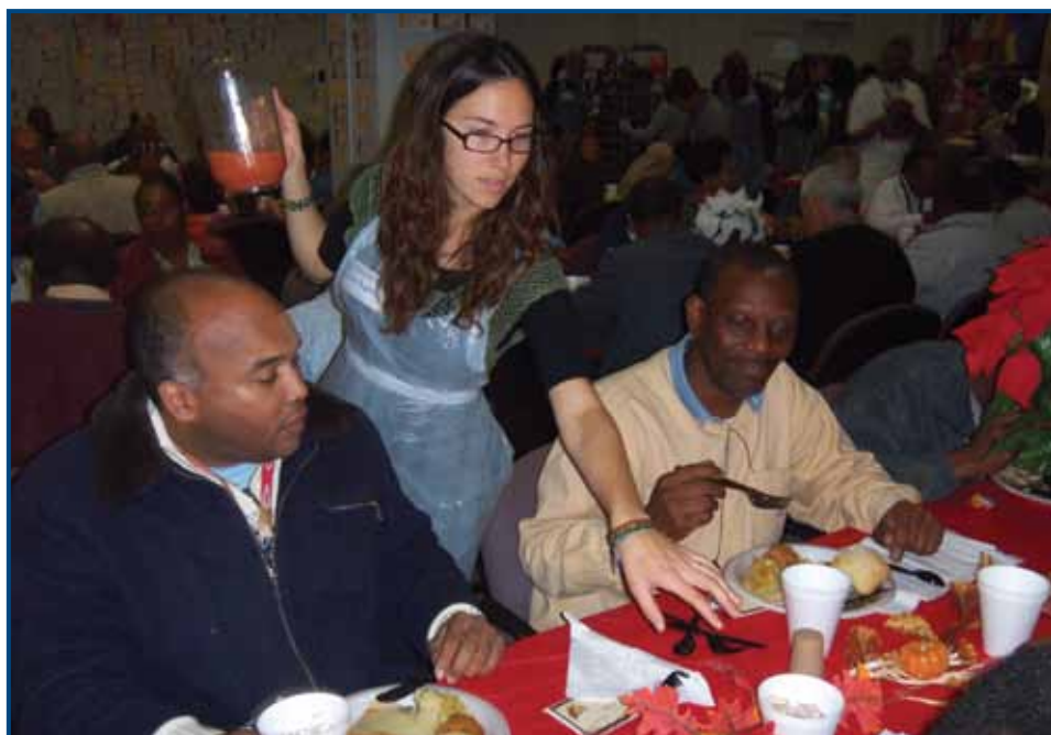
At Thanksgiving, a turkey dinner shows God's love.

This is a cold, lonely time of year that drives lost men, women and even families to your Mission. Your generous gift will be transformed to meet them with God's love and acceptance. Please help us fill our tables with turkey for desperate people in our nation's capital. ■