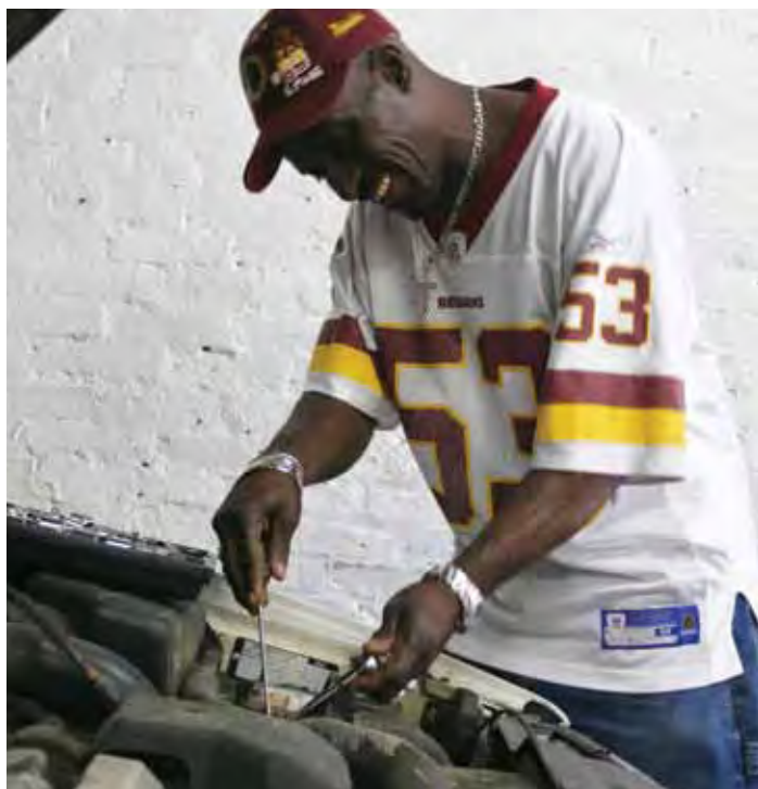
Your old car has a new life at Central Union Mission.

Do you have anything used but useful cluttering up your basement or garage? Please contact TaJuanna Patterson at 202-MISSION ext. 235 for more information or to schedule a pick-up. ■