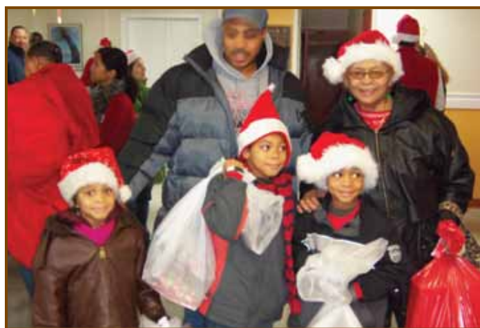
With your generosity, there's a merry Christmas for all.