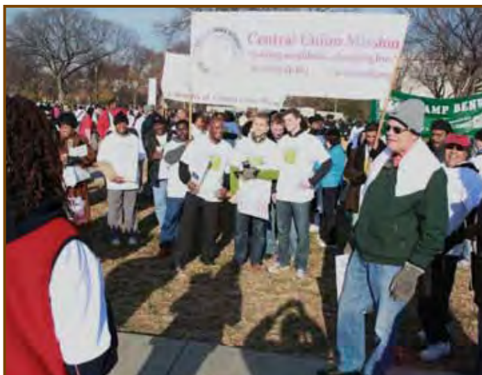
The Mission crowd at Help the Homeless Walkathon.