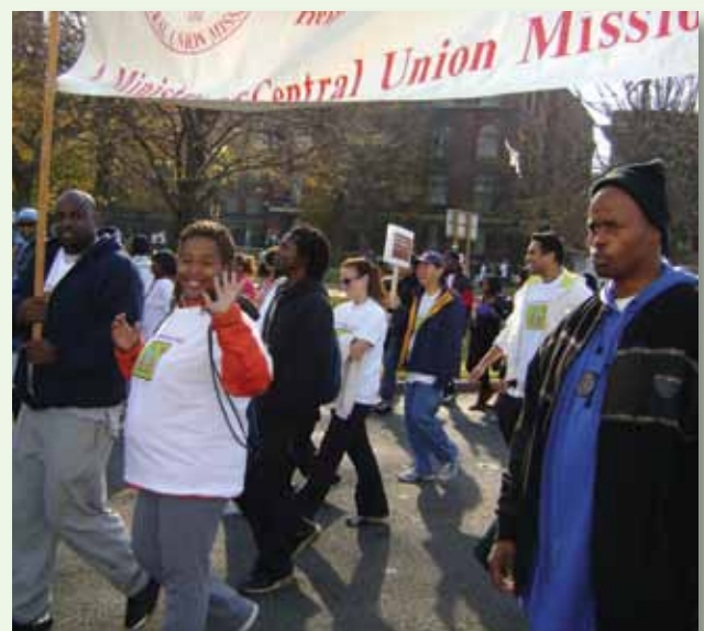
Join your Mission as we walk to show our compassion.

Please register in advance. You can visit www.helpthehomeless.org and select "Central Union Mission – DC015" as your team. Then on the big morning, meet us outside the Archives/Navy Memorial Metro station entrance (on the Green/Yellow line) at 7 th and Pennsylvania Ave. at 8:30 am. Just look for the Mission banner! ■