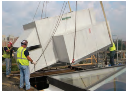
Warm in the winter, cool during summer. Contractors with Forrester Construction installed, with the utmost of care, a heating and air conditioning system in the historic Gales School.

However, since we sold our previous home at 1350 R Street, and the new owners were ready to begin their work, we had to find a temporary home for our guests. Our Men's Ministry Program, the arm of the