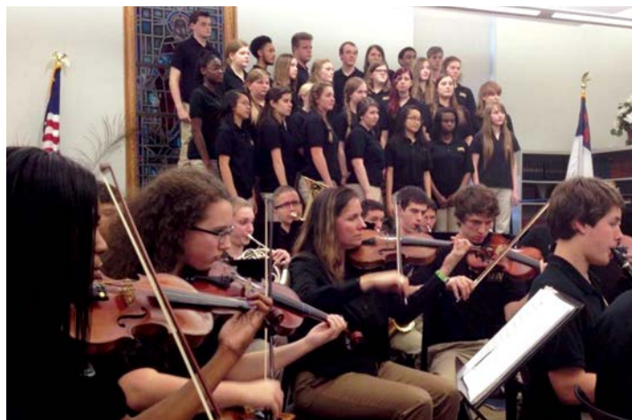
The talented Young Musicians of Virginia (Richmond, VA) gave the Mission men an entertaining concert playing everything from jazz to classical music. Thank you, YMV, for blessing the men with your music.

Your gift of $75 (at CampBennett.org/give ) will have lasting impact by paying for an entire day at Camp Bennett for one child. Do you know any children who would like to join us this year? Visit CampBennett.org for information and an application. We also need to fill both volunteer and paid positions for camp counselors and assistants. Please see CampBennett.org/employment for more information.