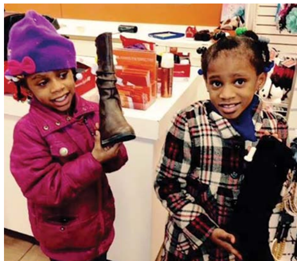
Payless ShoeSource really blessed our families this spring. After donating gift cards, Payless opened their store early one day in March so our neighbors could go shopping together. Low-income families never take new shoes for granted.