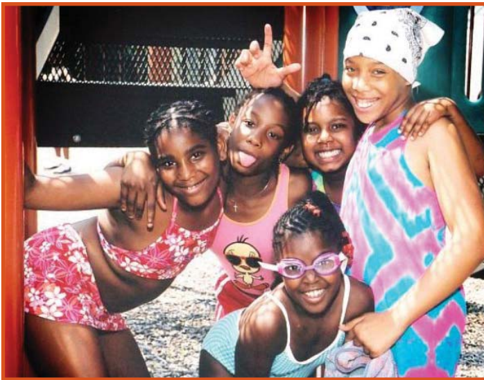
When you care, these kids can make friends, love God and have fun.

Of course you remember your early camping days: exploring nature, playing sports, making crafts, finding new friends and perhaps even sleeping away from home for the first time. Those summer experiences gave you a new independence and a taste for adventure.