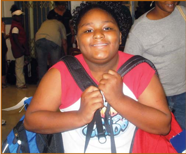
With your help, she's ready for learning.