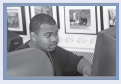
Educational services make a lifelong impact!