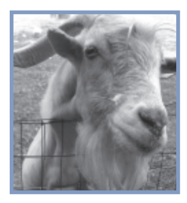
Our campers love animals. Your gift will allow a child to spend a week with new friends—animal and human!

For more information, ideas, or ways to connect, give us a call at 202-MISSION or visit us online at www.missiondc.org .