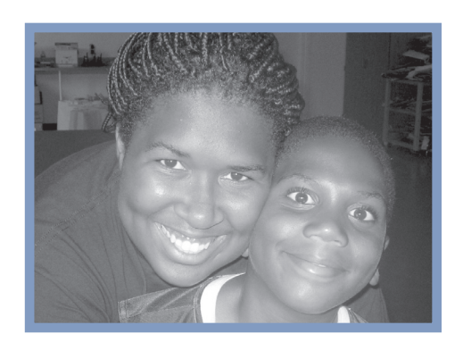
Bring a smile to the face of a child this summer through Camp Bennett!

the enclosed card, giving us a call at 202-MISSION or visiting us online at www.missiondc.org. Thank you for playing a part in building the future of our Washington, DC community through these young ones!