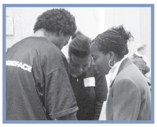
The Easter Luncheon provided an opportunity for true fellowship.