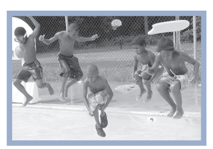
Campers jump into summer fun at Camp Bennett!