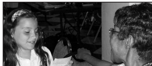
Students from Immanuel Christian School in Springfield, VA visited our Seniors Luncheon in May with gifts of goodies, cards and fellowship.