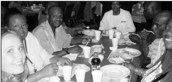
People from all walks of life gathered for food and fellowship.