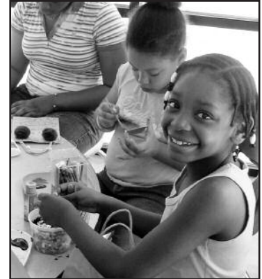
Bring a smile to a child's face with the gift of one week at Camp Bennett this summer.

Every summer, children all over the United States eagerly anticipate a week away at summer camp chocked full of outdoor fun, adventure, and discovery. Through its Camp Bennett ministry, Central Union Mission is pleased to extend this joy to children from the Washington area who would otherwise be unable to have such an experience. For just $40, you can provide one day of camp, including lodging, meals, swimming, a ropes course, Bible teaching, and loving counselors. Or provide an entire week of Camp Bennett for $200! To support Camp Bennett, simply reply with the enclosed card, call us at 202-MISSION, or give online at www.missiondc.org . And please don't forget to pray for Camp Bennett this summer!