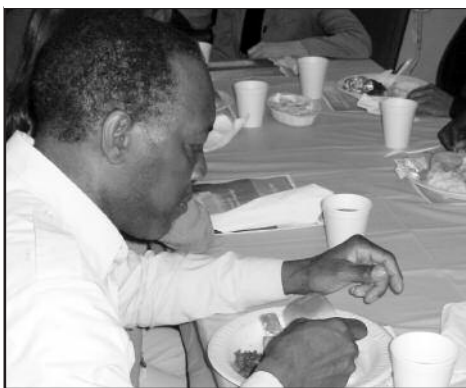
Guests feasted on ham, asparagus, mashed potatoes and cake.