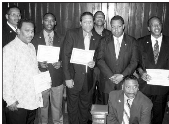
The proud graduates have come a long way!