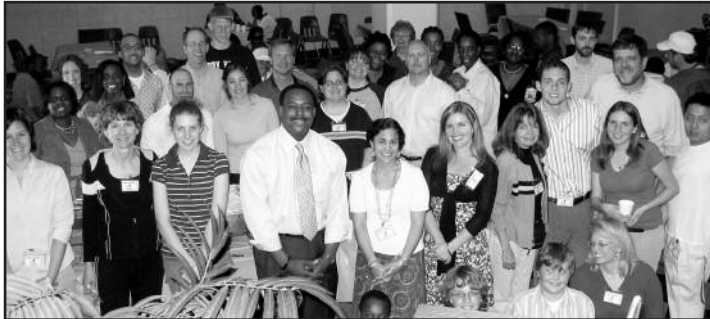
Our hard-working volunteers chose to spend Easter Sunday with some very special guests!