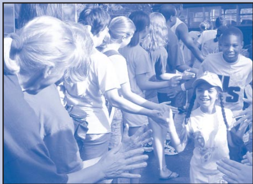
Arriving at Camp Bennett

Children and parents look forward to Camp Bennett all year. Parents speak of what a great experience their kids have and of knowing their kids are safe and nurtured. When asked about Camp Bennett the children break into a huge smile and talk about the friends they made, their favorite counselors, the pool, the ropes courses, songs, crafts and much more. Younger siblings cannot wait for their chance at camp and older teens wish they could return!