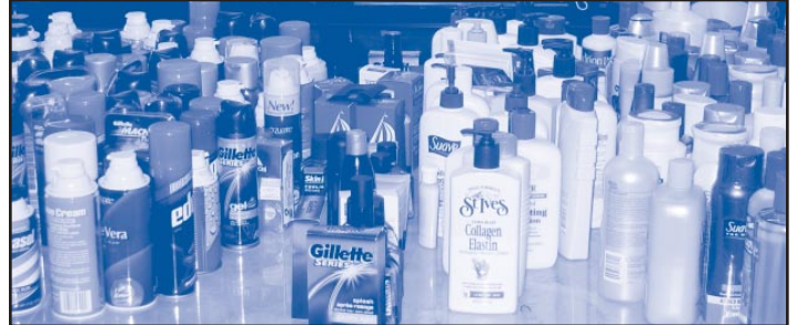
Donations from McLean Bible Church.

E aster is a special time at Central Union Mission. This year, as we celebrated our risen Savior, we distributed approximately 200 Easter bags filled with personal hygiene products to families facing economic difficulties, men in the Spiritual Transformation Program, and our overnight guests. For the third consecutive year, McLean Bible Church donated many of these items through their Love Thy Neighbor program! Thanks, McLean Bible Church!