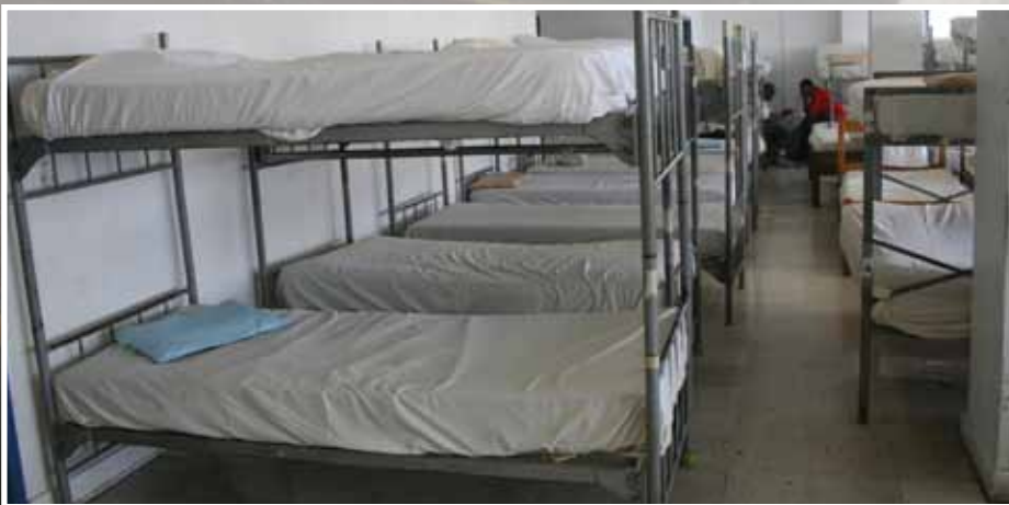
At “Clean, Safe and Polite” Central Union Mission, overnight guests get a nutritious meal, a hot hower and a clean, safe bed every night.