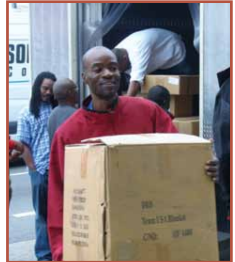
Overnight guests and STP students volunteer with World Vision DC's "Give Back Program."