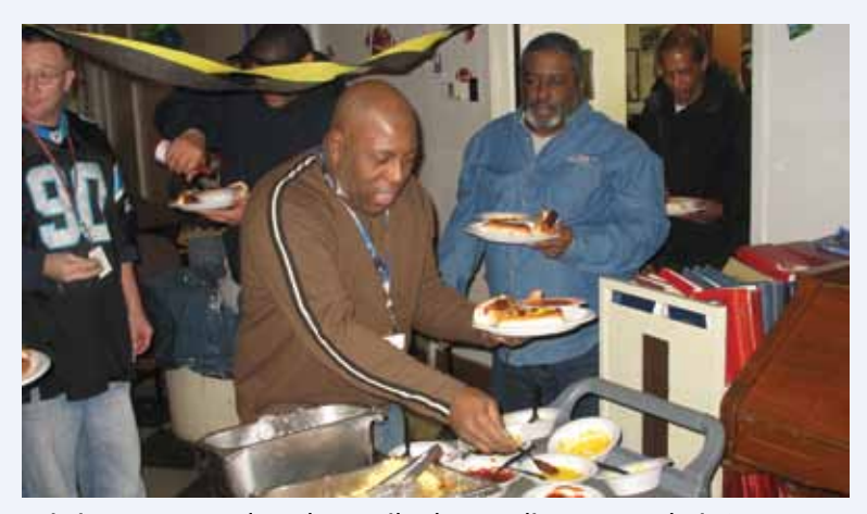
Mission guests and students pile the condiments on their Super Bowl chili dogs.

Benjamin Franklin (American statesman 1706-1790)