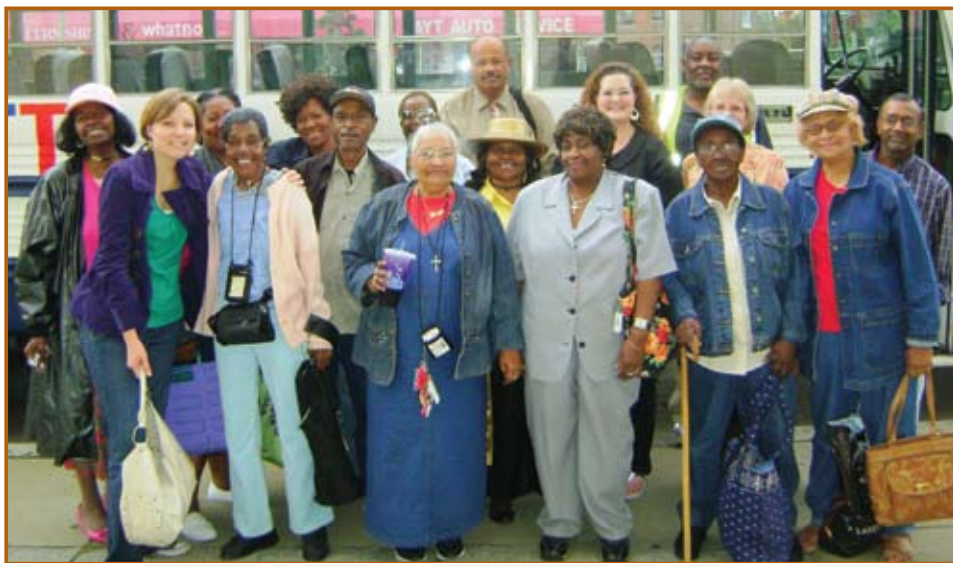
In September, seniors went on an outing to see I Can Do Bad All By Myself and enjoy lunch at Golden Corral.