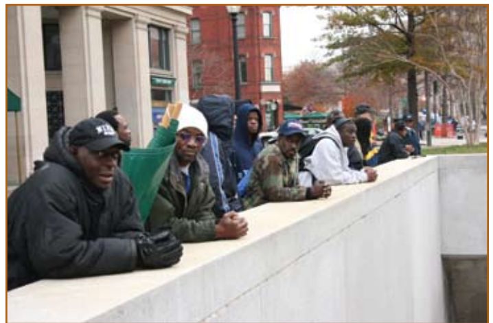
Some of the Mission's Overnight Guests, friends and sponsors participated in November's Help the Homeless Walkathon in downtown DC.