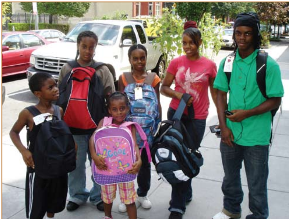
School success is easier with the right tools.