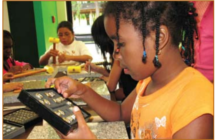
This Camp Bennett camper enjoys creating leather crafts.

Camp Bennett brings friends together and children closer to God. If you'd like to support or volunteer at Camp Bennett,