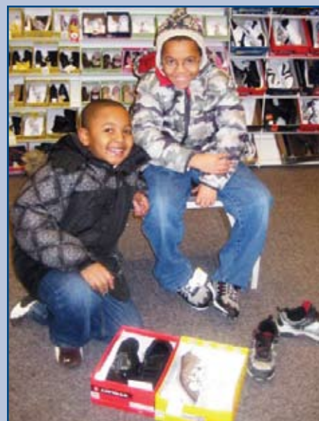
Payless donated 200 gift cards for Christmas distribution for the Children's and Hispanic ministries.

Central Union Mission participated in the 2009 Payless Gives Shoes 4 Kids Program, a grass roots campaign to deliver $1.2 million in free shoes to children of families in need.