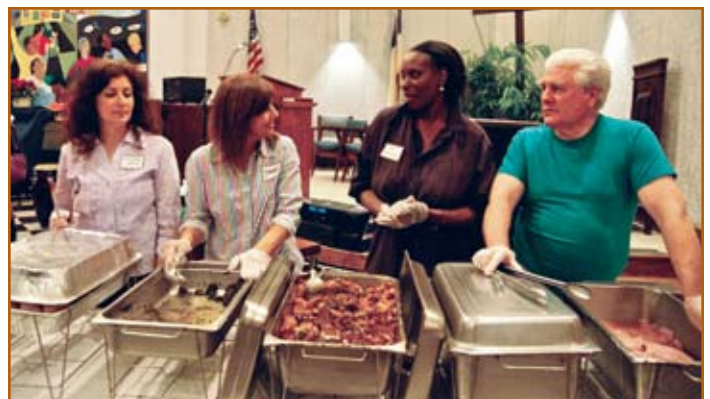
Generous volunteers serve up a delicious Easter luncheon.