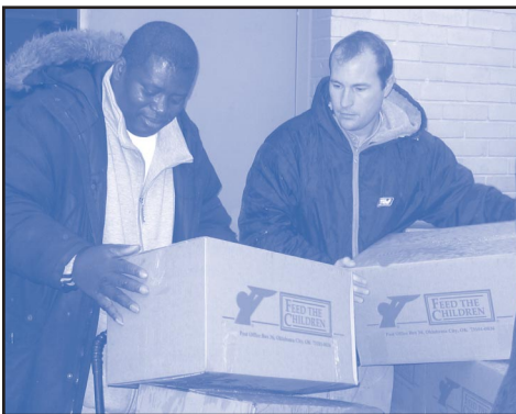
Unloading boxes of food from Feed the Children.