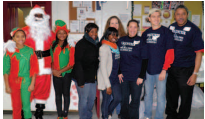
Our celebrity guests and precious volunteers know how to make the season bright!

As you prepare for your family's Christmas season, please remember the growing number of needy men, women and children in the Washington, DC, metropolitan area. We are so grateful for your generous financial donations, Christmas gifts and volunteer time.