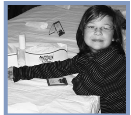
Holidays at the Mission are a time for young and old to come together and celebrate.