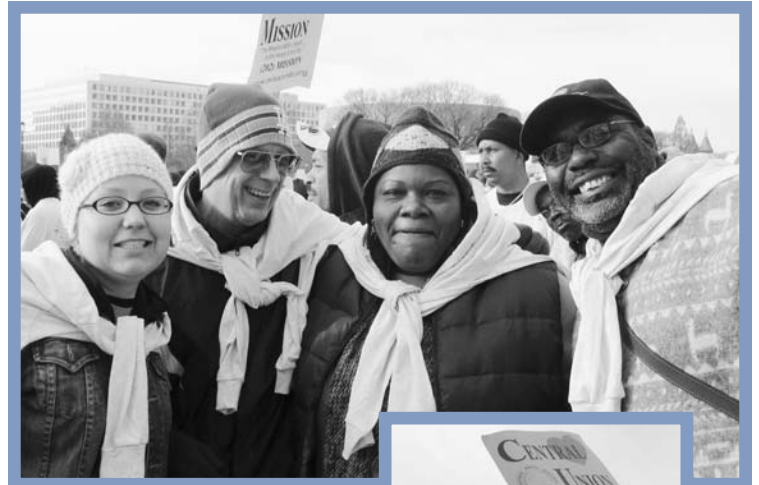
Laughter and songs warmed the Mission family walking together on the National Mall.

We were blessed to conduct two Mini-Walks in conjunction with the Walkathon. On November 1, the Mission partnered with students and staff from the Mamie D. Lee Special Education Center. And on November 2 we spent the morning with students at the Potomac Lighthouse Charter School. Each Mini-Walk consisted of a short presentation on homelessness followed by its own ‘walkathon’ within the building. Many thanks to both schools for their support and participation! ■