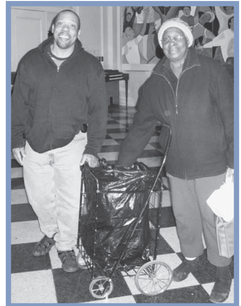
Ready for warm meals on chilly winter days with groceries from Central Union Mission!

For more information, please contact us as 202-MISSION or visit us online at www.missiondc.org . ■