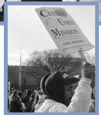
Thank you to the men, women, and children who supported the Mission by walking!