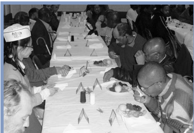
We gave thanks for abundant resources to feed our many visitors.

Make plans now to join us for Christmas dinner at noon on December 25.