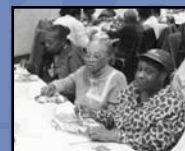
Giving thanks together, Page 3