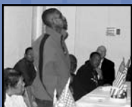
Honoring our Veterans, Page 3