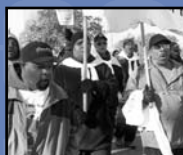
Help the Homeless Walkathon, Page 3