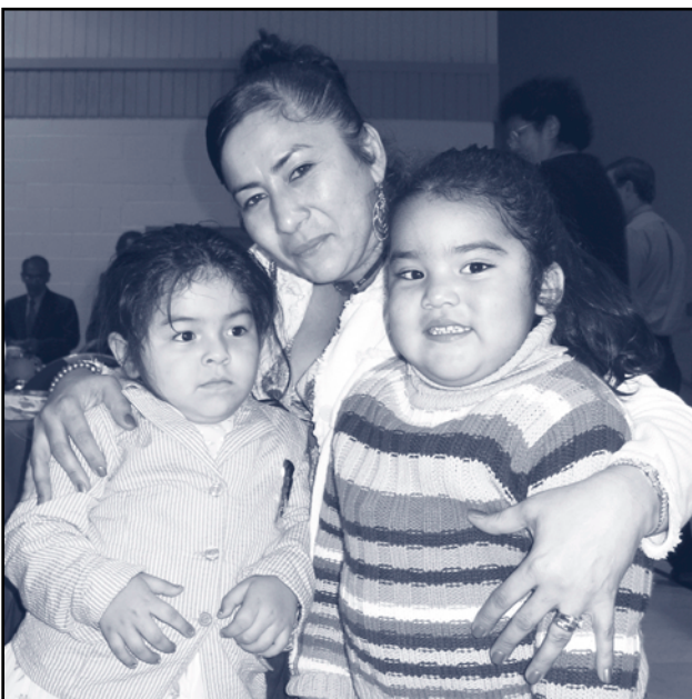
We were excited to celebrate the lives changed at the Hispanic Ministry this fall.

Come turn the world upside down, one life at a time!