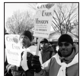
Participants from the Spiritual Transformation Program support the Mission at the Walkathon on the National Mall