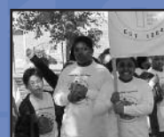
Local Students Fight Homelessness Page 3