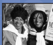
Help the Homeless Walkathon Page 3