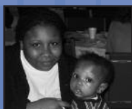
Thanksgiving Festivities Page 2