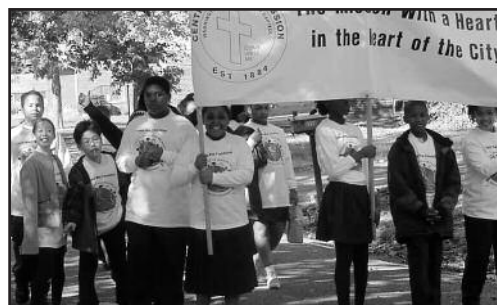
Sixth graders from Princeton walk boldly through the neighborhood in support of Central Union Mission

On November 19th, Central Union Mission participated in the Fannie Mae Foundation's 18th Annual Help the Homeless Walkathon on the National Mall. Many friends of the Mission came out to join over 20,000 people walking in support of the fight to end homelessness. In the weeks leading up to the Walkathon, two local schools partnered with the Mission to host Mini-Walks for their students. Thank you to the students and staff at Princeton Elementary in Suitland and The Kennedy Institute in DC for the time and energy they gave to fighting homelessness!