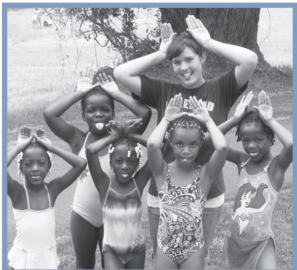
A group of campers pauses for a silly picture on their way to the swimming pool!

Thanks to our faithful and supportive donors, Central Union Mission was privileged to welcome over 350 children to Camp Bennett this summer. For seven weeks, children from the Washington area experienced exciting activities such as swimming, ropes course, campfire, and our very own petting zoo. When paired with a week full of worship and Bible study, this proved to be a life-changing summer! Thank you for your support! ■