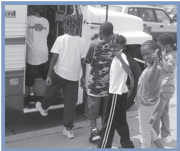
Campers load the bus for the first week at Camp Bennett.

Thanks to our faithful and supportive donors, Central Union Mission was privileged to welcome over 350 children to Camp Bennett this summer. For seven weeks, children from the Washington area experienced exciting activities such as swimming, ropes course, campfire, and our very own petting zoo. When paired with a week full of worship and Bible study, this proved to be a life-changing summer! Thank you for your support! ■