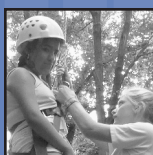
Page 2 Camp Wrap Up