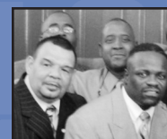
Page 4 2005 STP Graduation