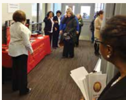
Mission staff and volunteers welcome visitors to the Gales School lobby, sheltered from the spring snow falling outside.