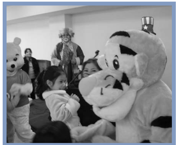
Parents were grateful for a fun activity for their children.

Thanks to the continued support of our donors, Central Union Mission can provide such events to supplement our ongoing programs. ■