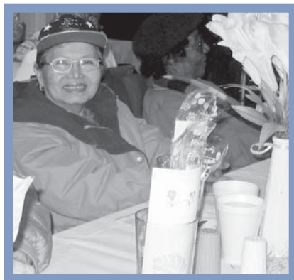
Christ has risen—a reason to celebrate indeed!

On Saturday, March 15, the Mission's Hispanic Family Ministry coordinated its 3rd Annual Hispanic Family Day at Camp Bennett. Over 300 men, women, and children from the HFM attended the event, which took on special significance in light of financial problems in the Hispanic community