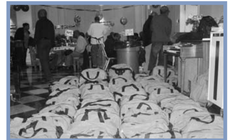
Many of the socks were used to fill the gift bags at the Birthday Party.

Special thanks go out to all who donated their time and efforts to help make this year’s birthday party a success! ■