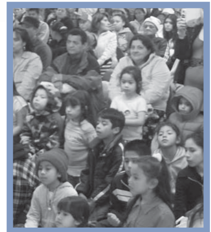
Our largest Family Day yet!

related to the real estate market's recent fall. At least 60% of adult HFM clients used to work in that field. For many families in the Hispanic community, working multiple jobs and separated families mean that time together becomes a precious gift. Family Day gave them the opportunity to spend time together through the provision of space, food, activities, and transportation. Activities included clowns, horse rides and a meditation from the Bible about the importance of the family.