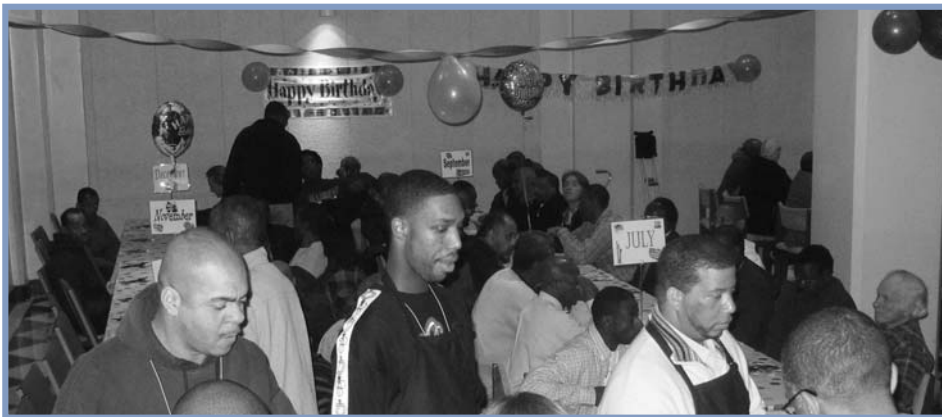
The chapel was transformed into a blowout birthday bash!

O n Thursday, February 21, the Mission held its 9th annual Overnight Guest Birthday Party. The chapel was decked out in balloons, streamers and a giant banner declaring, “Happy Birthday!” Guests were invited to sit at a table representing their birthday month. After a home cooked meal of chicken and potatoes, the whole room sang “Happy Birthday” as cake was passed out to each person. And it wouldn’t be a birthday party without gifts! Each individual