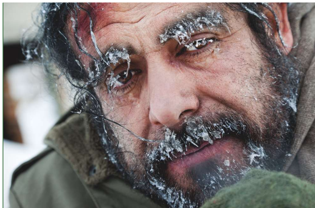
Your gift to Central Union Mission makes new lives possible for hungry and desperate souls. Please send your donation today.

FOR SOME HOMELESS PEOPLE in Washington, DC, Christmas is nothing more than another short, cold day in their struggle to survive on the streets. Because of your support, our needy neighbors can enjoy not only a festive meal but also the hope that comes from loving God and the future that the Mission's employment programs provide.